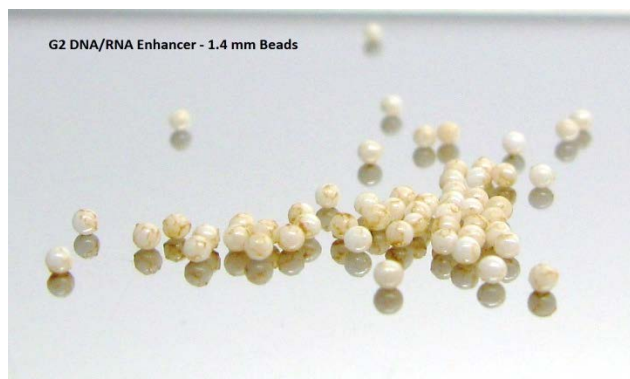
EFFECT OF ADDING G2 DNA/RNA ENHANCER ON DNA YIELD

G2 DNA/RNA Enhancer is convenient to use, when optimal DNA and or RNA extraction yield is required from especially clay. The primary function of G2 DNA/RNA Enhancer is to relieve inhibitory DNA-clay particle formations. G2 DNA/RNA Enhancer should be used in combination with either standardized extraction methods or commercial kits intended for DNA & RNA extraction from soil and clay. (Patent EP2 443 251)