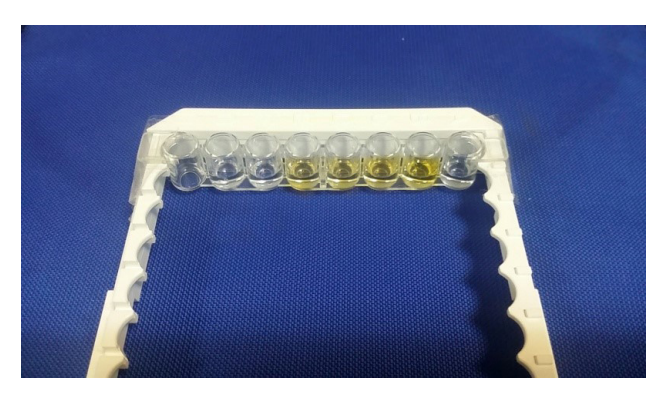
Fig. 2 From right to left, the first well is negative control and there are respectively dilutions of DNA of Brucella : 955 ng/ \mu L, 95.5 ng/ \mu L, 0.95 ng/ \mu L, 0.095 ng/ \mu L

Furthermore, for determining sensitivity of Multiplex-PCR, according to concentration of genomic DNA as 955 ng / \mu L for standard strains B. abortus S19 and B. melitensis 16M, the best product was obtained from 10^{-2} (equivalent 9.55 ng / \mu L) of genomic DNA.